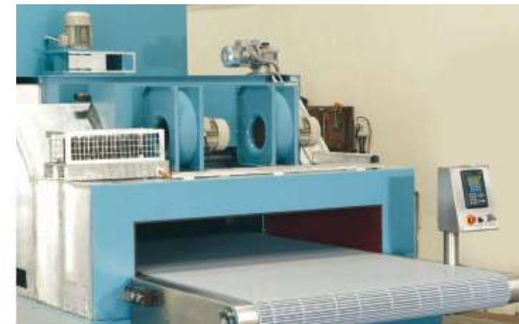
SO 100TS version is also available.

Power Saver Steam Booster Specially developed steam circuit. Indirect steam heating saves Two Lakh units of electricity per annum.